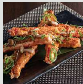
KING CRAB LEGS